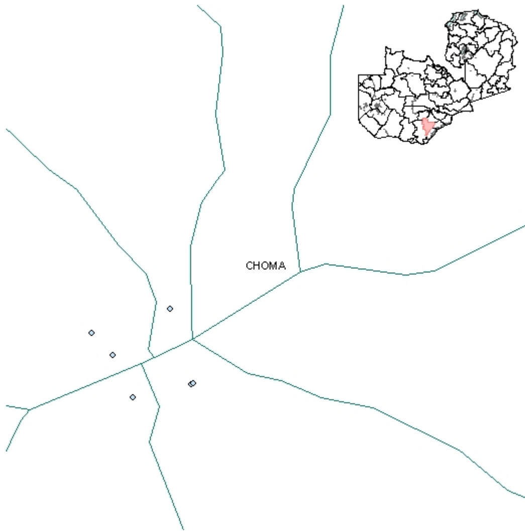
Figure 3: Households enumeration reported sprayed in the previous 12 months

Blue dots = houses reported sprayed within the previous 12 months