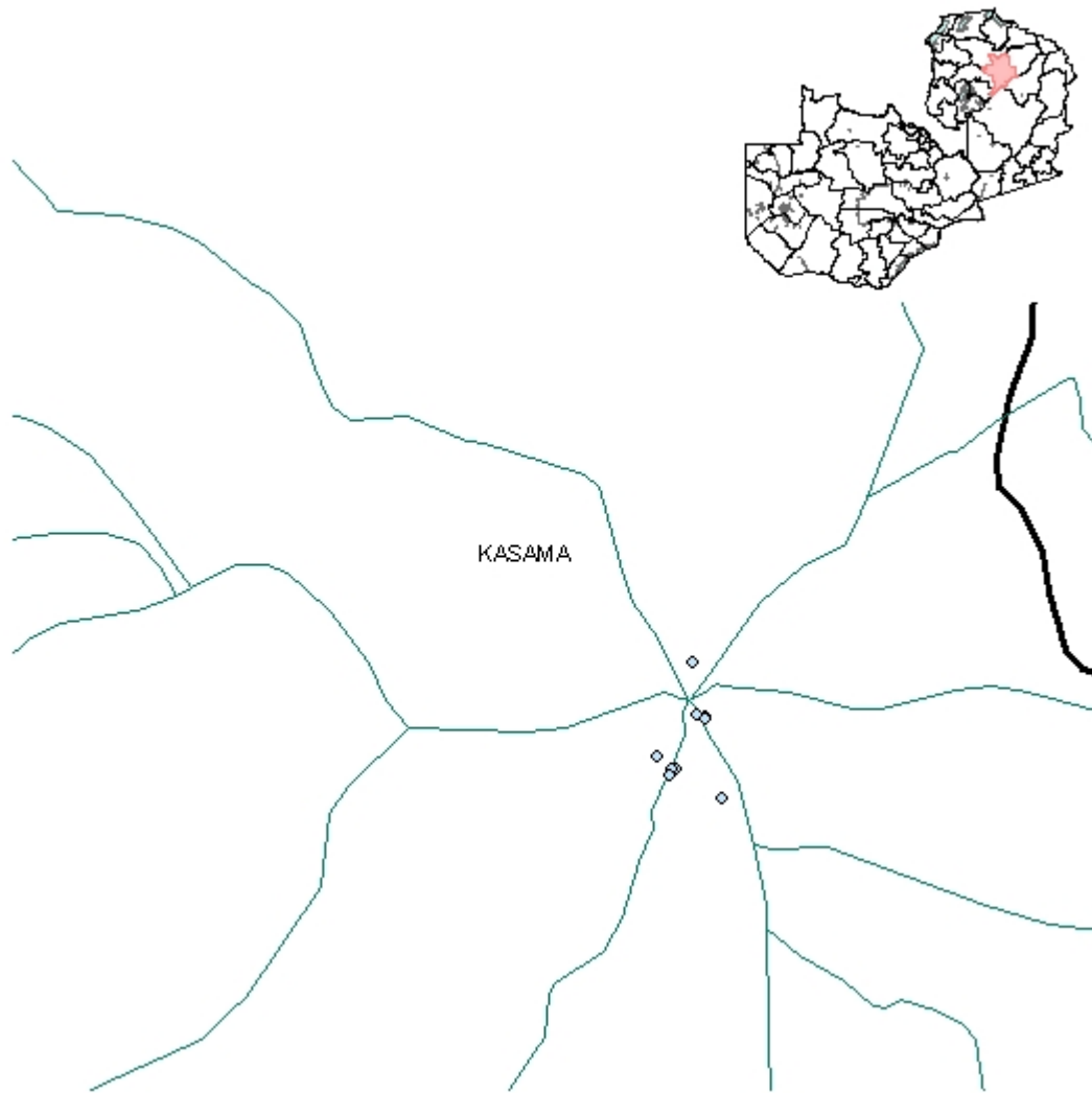
Figure 3: Households enumeration reported sprayed in the previous 12 months

Blue dots = houses reported sprayed within the previous 12 months