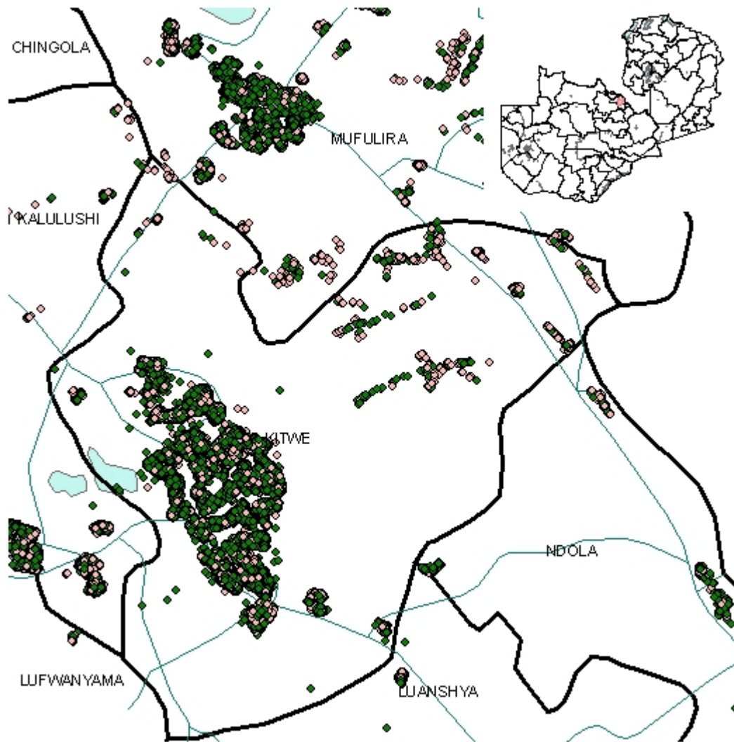
Figure 1: Household enumeration activities by mosquito net availability

Green dots = households with nets Pink dots = households with no net